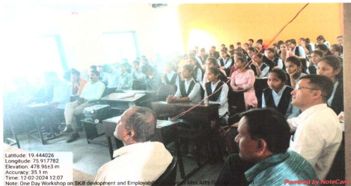
Participated Students and Faculties of the programme on dated 12.02.2024